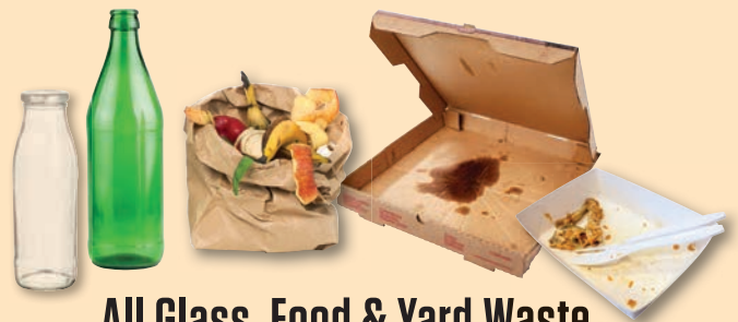
All Glass, Food & Yard Waste