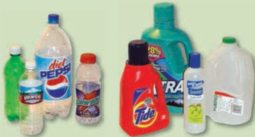
Empty Plastic Bottles & Jugs