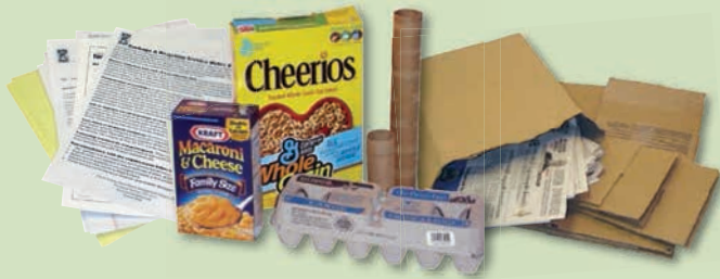
Clean Paper & Cardboard

Cardboard, paper, plastic bottles, and cans.