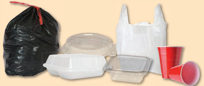
Other Plastics & Styrofoam™