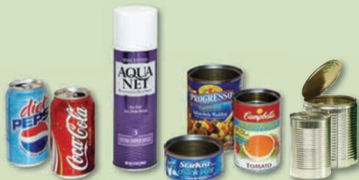
Empty Aluminum & Steel Cans