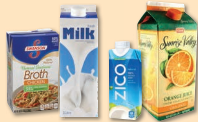
Coated Paper Containers

Plastic bags, food waste, glass, or Styrofoam™.